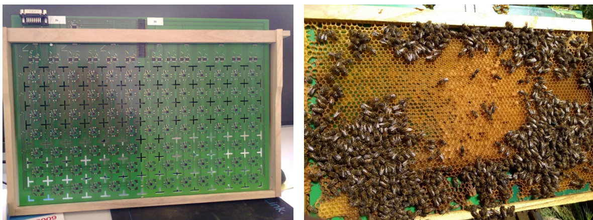
Figure 1 left: A beehive panel consisting of 13 x 7 sub-areas having a size of 30 mm x 30 mm. Each sub-area is equipped with one temperature sensor and four individually controllable heating diodes. Right: A Honeycomb build-up on top of such a beehive panel together with a brood of worker bees.

The sensor support (Figure 1) is designed to support honey bee health within a beehive by aligning with their natural communication and environmental. It operates within a 15 Hz to 300 Hz eigenfrequency range, preserving vibrational signals like the waggle dance across both sides of the frame – unlike conventional rigid frames that dampen these signals. In addition, the included grooves (Figure 1, left) enhance communication by allowing pheromone and gas exchange while enabling fine-tuning of the eigenfrequency. As heating elements and sensors are integrated in every sub-unit, the design provides precise, localized temperature control, replicating natural thermal gradients for optimal hive conditions. An example of the resulting heating scheme is shown in Figure 2. Furthermore, a wax-coated honeycomb surface minimizes disruption, ensuring bee acceptance while maintaining minimally invasive design (Figure 1, right).